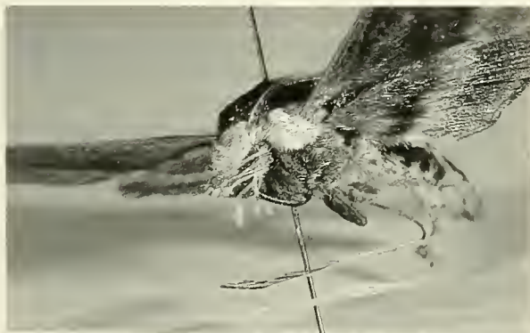
FIG. 3. Anterior/lateral view, Sphinx drupiferarum J. E. Smith with pollinia from Platanthera praeclara attached to eyes.

Marking experiment. In 1999 one sphinx moth, H. gallii , was collected from a cone trap with traces of Day-Glow® orange marker dye powder on both eyes and the proboscis. Both pollinia attached to the eyes also had traces of powder, primarily on the massulae and viscidium.